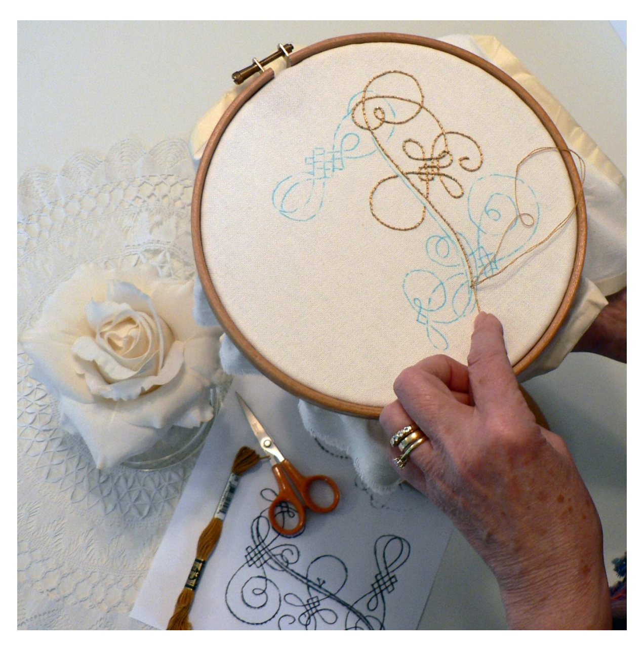
Fig.5 The fabric is mounted in a seat frame to allow easy access above and below the work

Once the design has been traced onto the fabric select an appropriate thread and lay it along the line of the design. Using a finer needle and matching or contrasting thread stitch over the laid thread with a small stitch. Keep the stitches an equal distance from each other. Bend the laid thread round the curves. Where threads overlap, stitch either side of the laid thread, but do not pull too tightly!