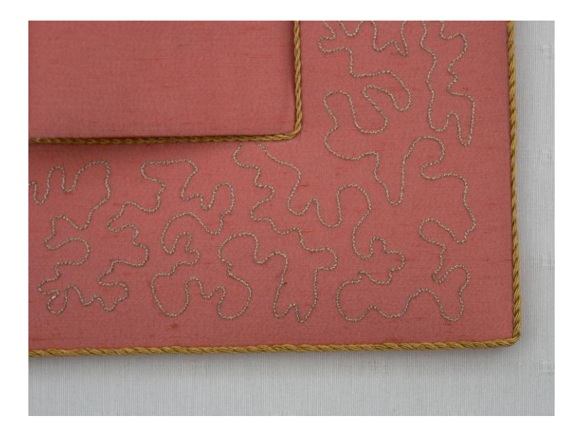
Fig.9 Corner frame of mirror box