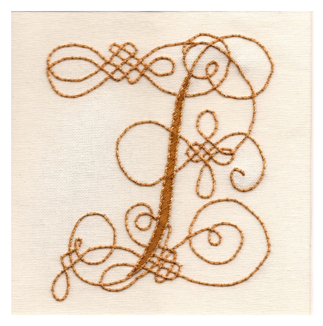
Fig. 7 Satin stitch worked along part of the design to add extra depth.