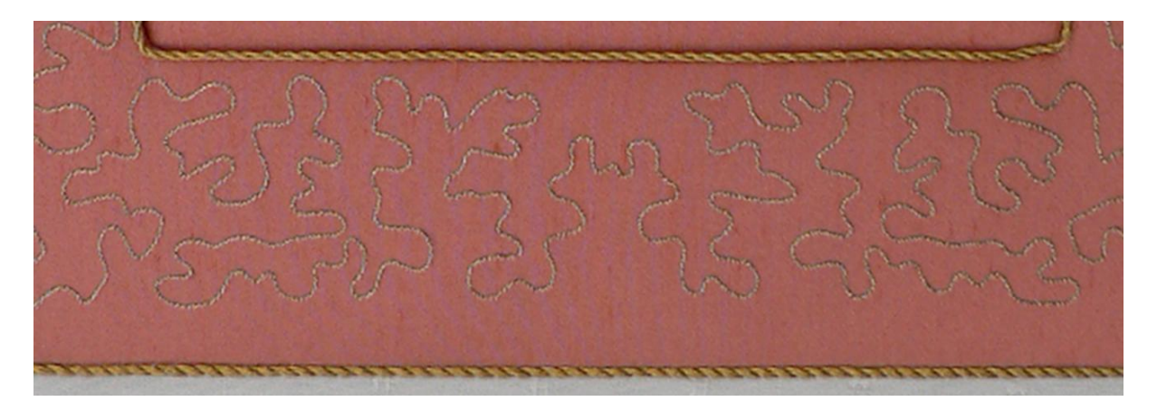
Fig.2 Surface couched threads on a mirror frame

With surface couching the thread is laid on the surface and caught down from the top to the back with a small stitch.