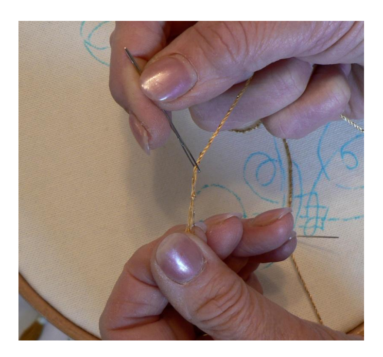
Fig.4 if the braid is prone to fraying, knot the end after passing it through to the back of the work.

Use a sharp needle with a large enough eye to take the laid thread without fraying. Pull the tail of the laid thread through to the back of the work and leave without anchoring. This will be anchored and trimmed at a later stage.