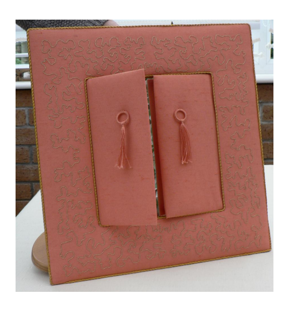
Fig.8 Mirror box in satin dupion embroidered with couched gold thread.