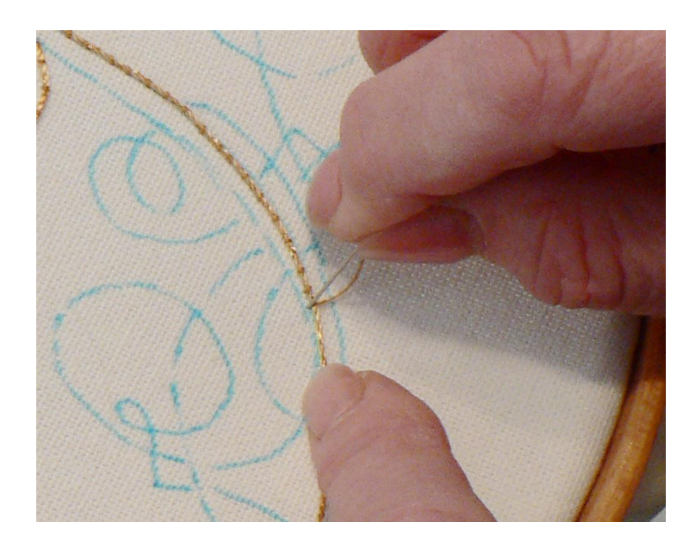
Fig.6 Even stitches approximately a quarter of an inch apart hold the surface braid firmly in place

When the laid threads have been couched down, turn the work over and catch the loose ends along the length of the small stitches so that the ends do not show on the right side of the work