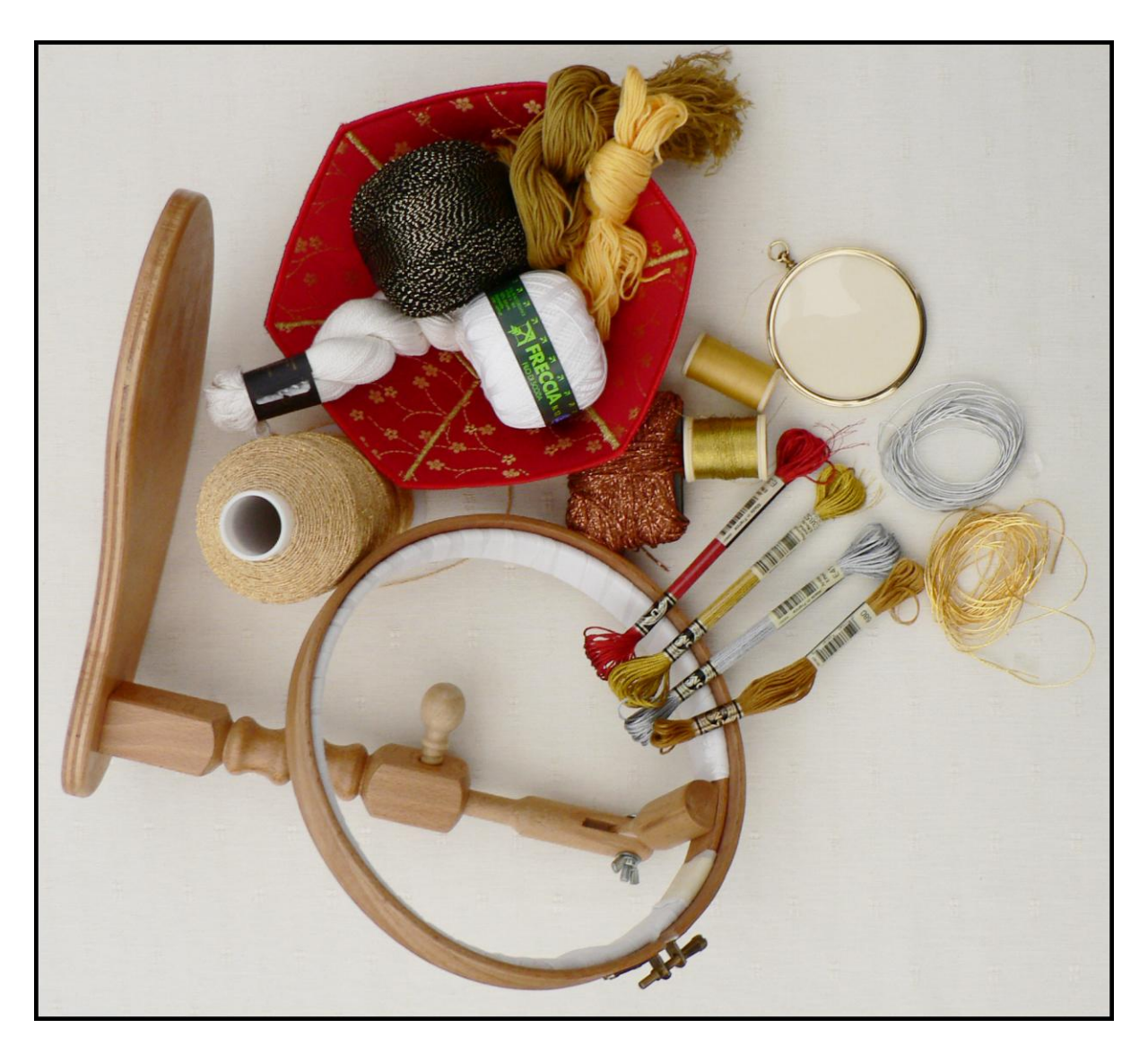
Fig.3 Seat frame and threads suitable for couching

The thread is brought up from the back to the front of the work. A small stitch is made over the laid thread and the needle passed through to the back.